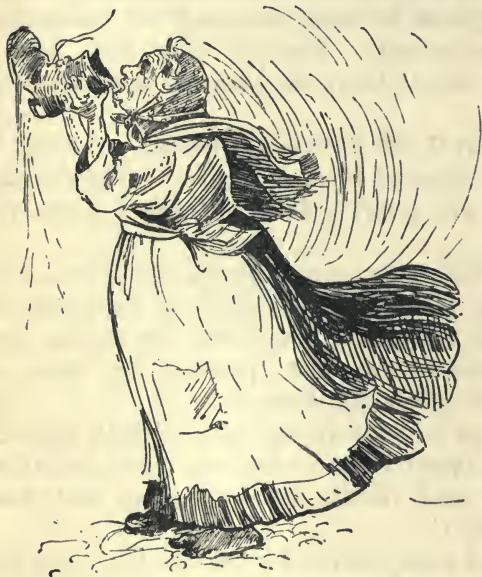
OUT OF THEIR BOOTS

became more and more unbridled. Murray sent for more men and a doctor, and we slaved on hopelessly in the dark; collaring half-drunken men, shoving pig-headed casks up hills of shingle, hustling in among groups of roaring drinkers—